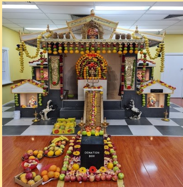
Sydney Sri Ayyappa Temple