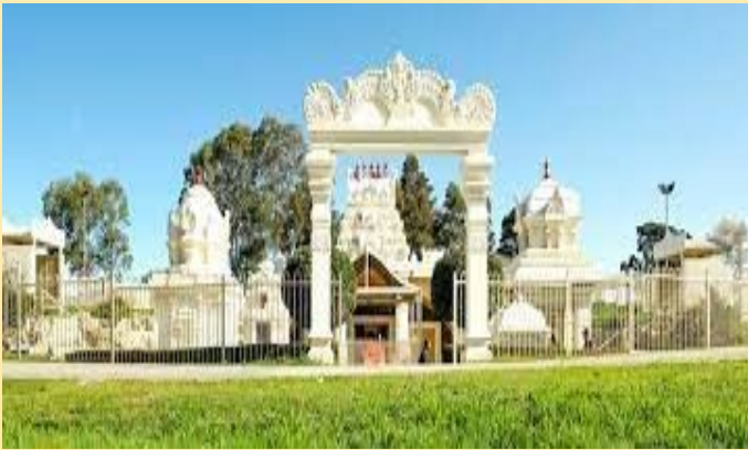
Shri Shiv Mandir, Minto

(In the year 2020, the event was not organized due to Covid-19 pandemic)