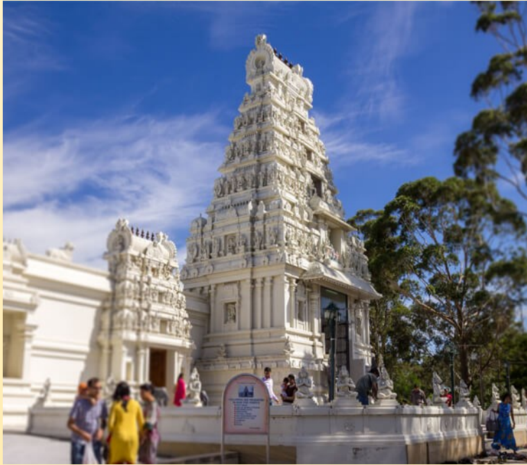
Shri Venkateswara Temple, Helensburgh